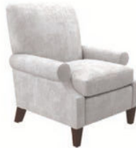
Clayton HC09236-09 34w x 36d x 40.5h