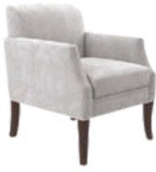
Collins Chair HC09219-05RS 27w x 31d x 35h