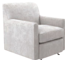
Clark HC09103-03 31w x 34d x 35h