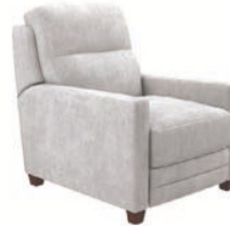
Colette HC09298-09 33w x 39d x 39.5h