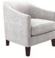
Ogden HC09250-05 28w x 31d x 31h