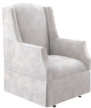
Camille HC09115-03 29w x 30d x 42h