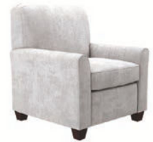
Flynn HC09239-09 34w x 34d x 39h