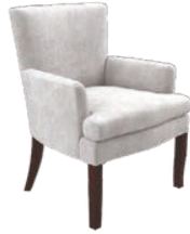
Miriam HC09117-05RS 27w x 29d x 35h