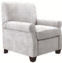
Cate HC09238-09 34.5w x 34d x 39h